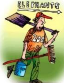
pig at the zoo