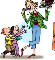
that's not fair