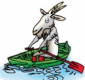
goat in a boat