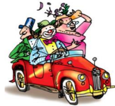
start the car