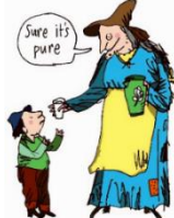
sure it's pure