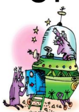
shut the door