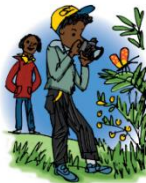
take a photo