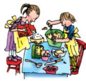
make a cake