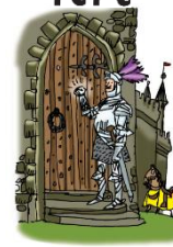
knock knock, who's there?