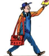
a better letter