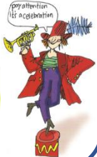
attention for attention