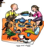
cake and pizza