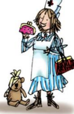
nurse with a purple