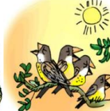
yawn at dawn