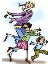
whirl and twirl!