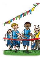
go fast and slow