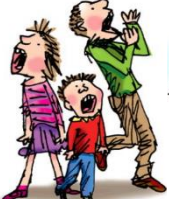
shout it out