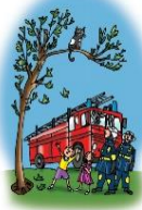
come to the rescue!