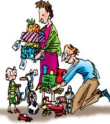
spill the boy