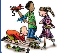
may I play?