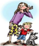
please, with your ear