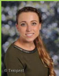
Mrs Butterwood Generous Giraffe Teacher