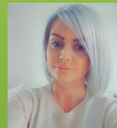
Miss England Teaching assistant